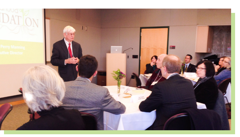
Blue Ribbon Panel, January 2014

A Blue Ribbon Panel of distinguished business, philanthropic, and civic leaders met to offer advice into the organization's core principles and strategies and recommend other influential leaders to champion our goals. <u>Read More</u> \Rightarrow